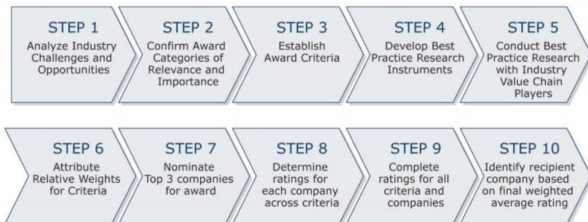
Chart 2: Frost & Sullivan’s 10-Step Process for Identifying Award Recipients

This exercise encompasses all criteria, leading to a weighted average ranking of each company. Researchers can then easily identify the company with the highest ranking. As a final step, the research team confirms the veracity of the model by ensuring that small changes to the ratings for a specific criterion do not lead to a significant change in the overall relative rankings of the companies.